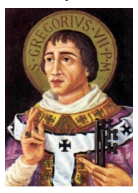
Pope Saint Gregory VII (b. 1015 d. 1085)

principles of a new-modelled papal absolutism.<sup>2</sup> The Pope declared in blunt and uncompromising terms that secular princes and kings were subordinate to the spiritual authority vested in the "Roman Church [which] was founded by God alone". For Gregory, it followed that "the Roman Pontiff alone is rightly to be called universal". The Pope took it as axiomatic that he alone, as the Vicar of Christ, possessed the power to "depose and reinstate bishops".<sup>3</sup>