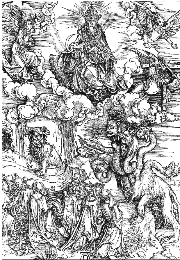
Albrecht Dürer, “The Apocalypse Of St. John,” image of the seven-headed beast and the beast with lamb’s horns (Rev. 13), 1496–98 woodcuts, from the Wetmore Print Collection at Connecticut College.

IN CONCLUSION: FROM THE “ANTI-TRADITION” TO THE “COUNTER-TRADITION”